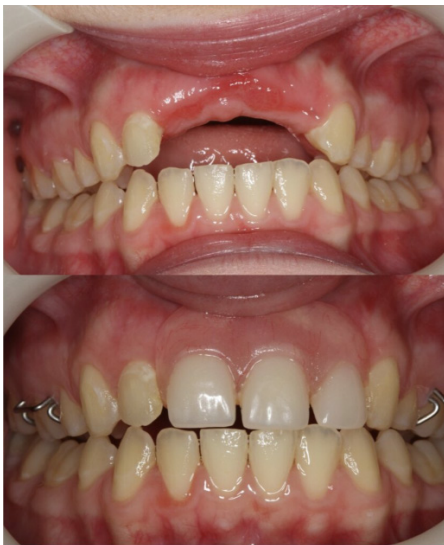
(Immediate denture for patient with traumatic tooth loss)