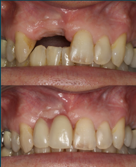
(Before and after immediate denture)

Immediate dentures are a TEMPORARY denture and will always be replaced by a definitive denture. It is important to keep appointments for your definitive denture and finish treatment as immediate dentures are not designed for long term use.